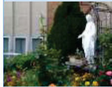
St. Gregory's Living Rosary Apostolate