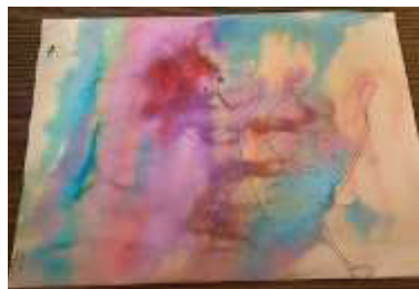
Agatha 6 years old