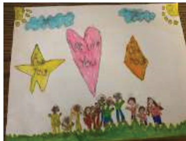
Emilia 5 Years old