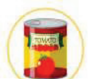
CANNED TOMATOES (WHOLE, DICED, CRUSHED)