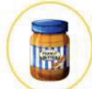
NUT BUTTERS (PEANUT, ALMOND)