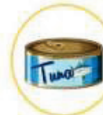
CANNED FISH (TUNA, SALMON, SARDI)