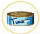
CANNED FISH (TUNA, SALMON, SARDINES)

St. Gregory's CWL is collecting canned and dry goods, as well as financial donations to help boost supplies at the local Daily Bread Food Bank.