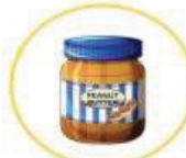
NUT BUTTERS (PEANUT, ALMOND)