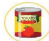
CANNED TOMATOES (WHOLE, DICED, CRUSHED)